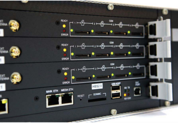
On-site Messaging API-based Unit

Enable sending and receiving of single and bulk SMS messages